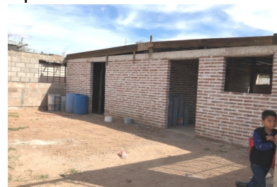
Before photo when purchased