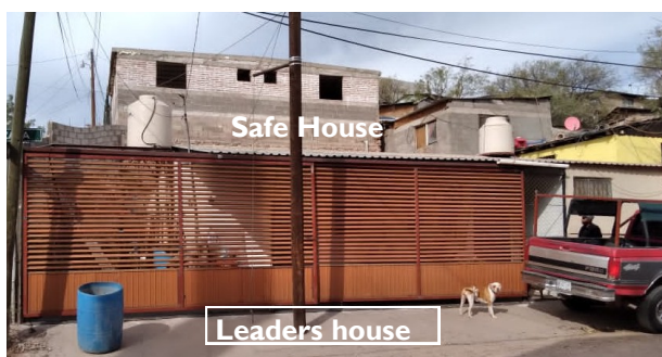
Above photo the Safe House