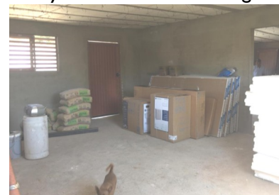
After photo of inside