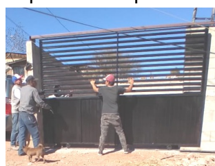
After photo plastering done/ Jaime made and installed security doors, windows and gate