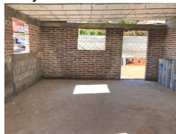
Inside before photo of living area